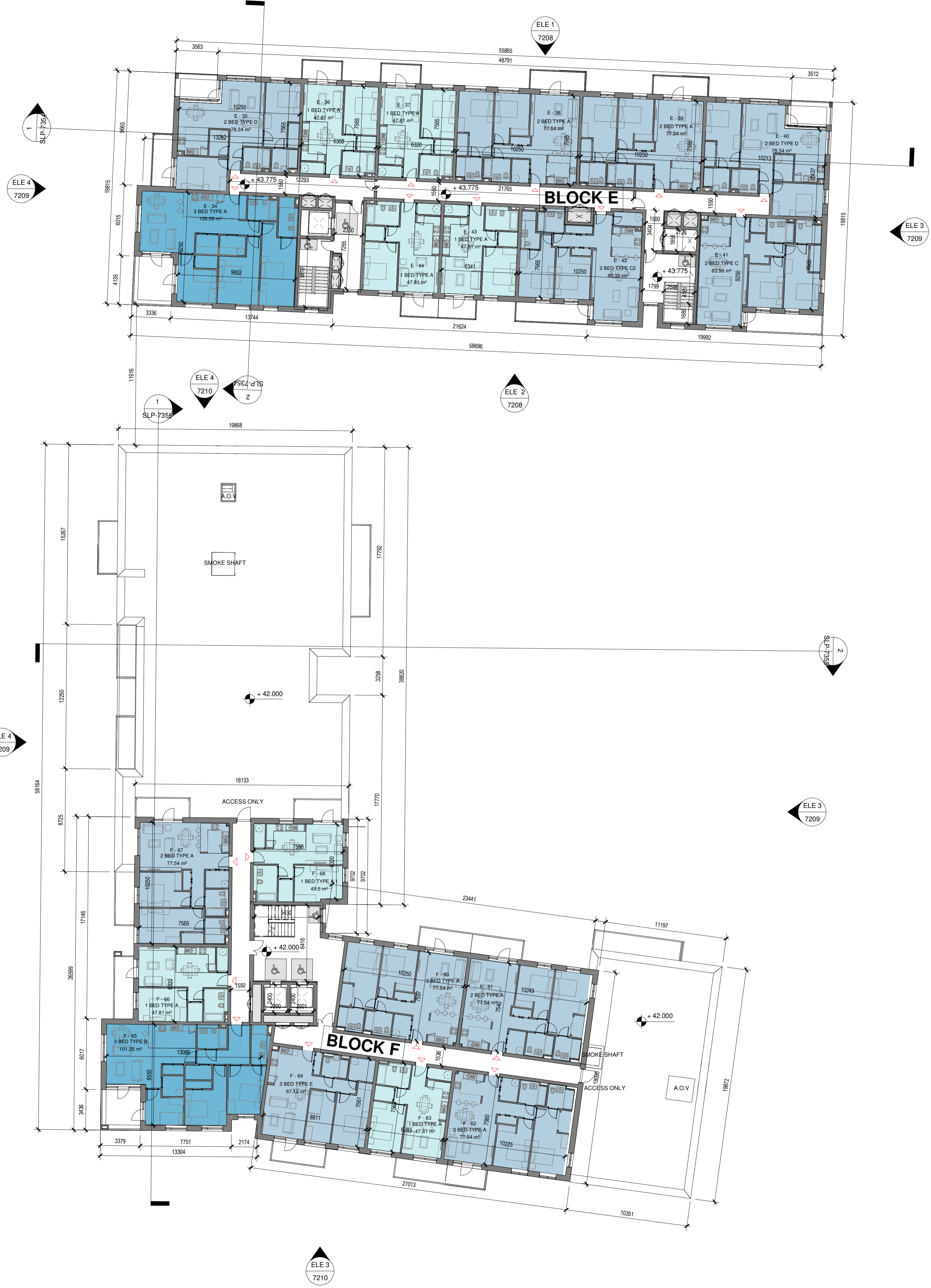
1 Floor Plan Level 04 Block E_F 1 : 200

MATCHLINE DRG. REFERENCE P18179-RAU-ZZ-XX-DR-A-SLP-7000